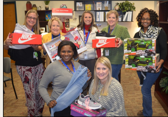
The Teachers and Administrators of Chapin Elementary School accepted the gifts from the Public Service Commission.

In December, the Commission came together for its annual Christmas Project. This year, staff and commissioners donated items to children in need from Chapin Elementary School. In all, the Commission was able to donate 4 pairs of shoes, 3 remote controlled cars, clothes, and sports gear to the children.