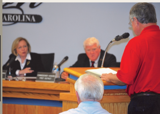
Commissioner Fleming questions a public witness during the Union night hearing in Docket No. 2013-199-WS.

In honor of breast cancer awareness month, the commission staff wore pink and attended an informational session about the disease.